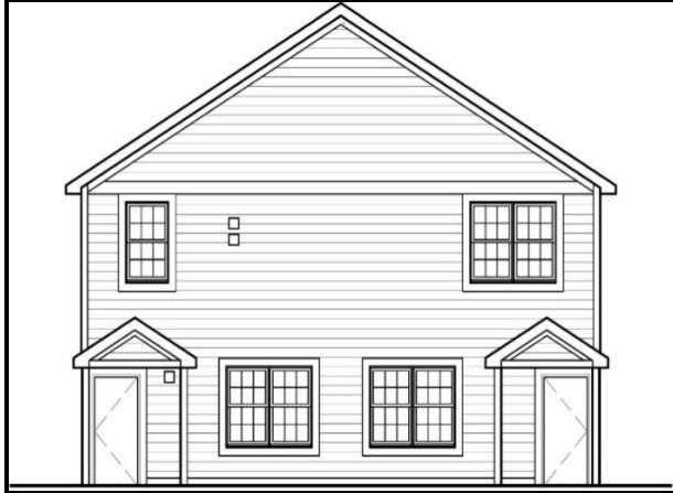
Rendering of the Exterior